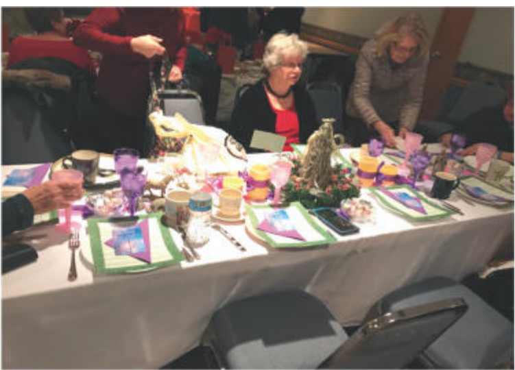
Here are a few pictures from the Advent Tea on December 5th. Everyone's table was so beautifully set! What a special evening. Fun was had by all!