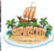
This year's theme