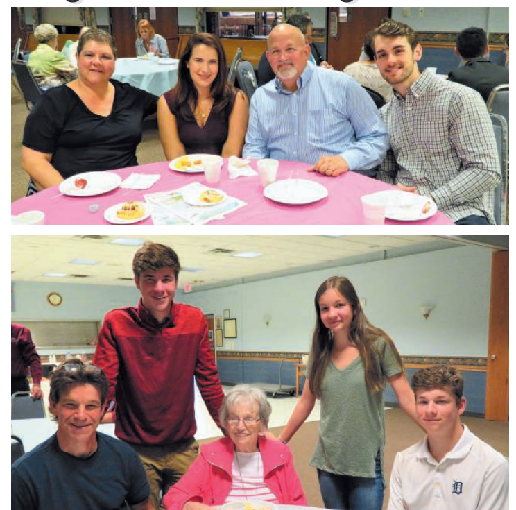
Some of our graduates and their families enjoyed breakfast here last weekend following the 10:15 AM Mass. wish them all the best in their future endeavors!