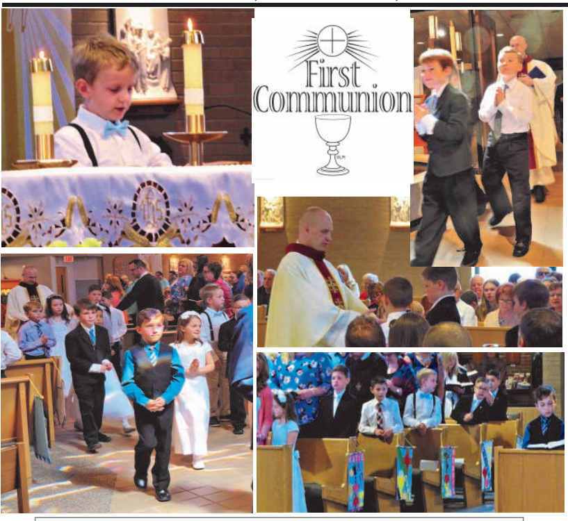
Last Sunday, 12 children received the sacrament of First Communion. We congratulate them as they continue on their faith journey.