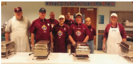
K of C Pancake Breakfast

Mercy Day in Action is fast approaching. We will be making fleece blankets for donation. In order to do this, we will need some fleece for the blankets. Please drop your fleece off in the bin at the entrance of the church. We need two pieces of fleece that are two and a half yards long for each blanket. If you have any questions or need more information, please call Christian Service at 248-476-7677, ext. 204.