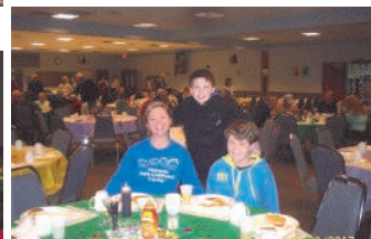
Some of our wonderful volunteers