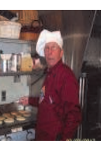
Lots of fun and fellowship!