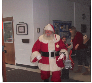
Many enjoyed themselves last Saturday working on craft projects for Christmas. Santa even stopped in for a visit.