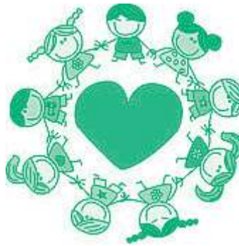
Prayer Intention Tree