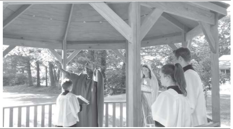
Blessing of the Marian Statue and Gazebo on Saturday, June 25th following the 5:00 PM Mass