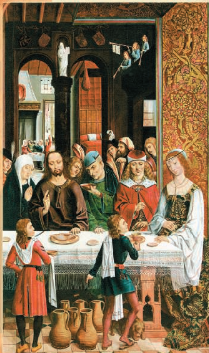
Cover Design: Liturgical Publications Inc. Image of The Marriage at Cana, by Master of the Retable of the Reyes Catolicos n.d., © 2007 by Denver Publications, Inc.